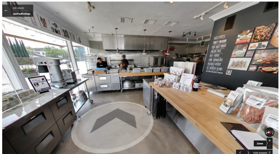
Business View of ‘Just Food For Dogs’ open kitchen in Newport Beach, California